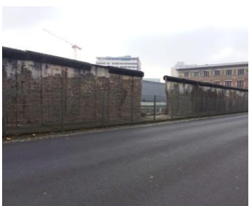
The Berlin Wall