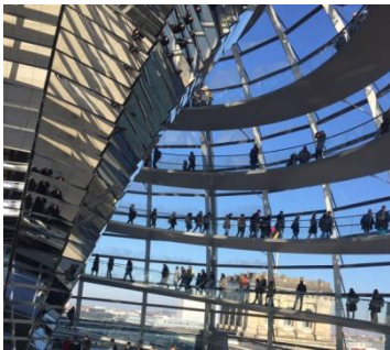
Glass Dome of the Reichstag

The Bauhaus Museum will not fail to inspire you. Housed in a building designed by the movement's founder, the archives trace the history of Bauhaus architecture.