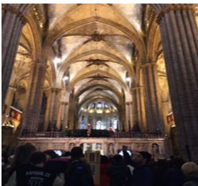
Don't forget to include a walking tour