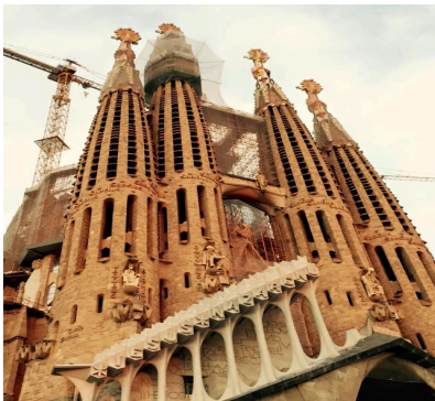
Gaudi's Sagrada Familia

Any art or design field trip to Barcelona is incomplete without a visit to the magnificent Sagrada Família Cathedral, Gaudi's most famous and still unfinished piece of work to truly inspire any student's creativity.