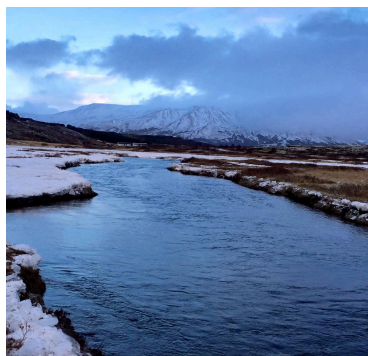
Pingvellir National Park